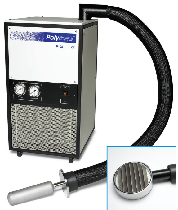
The P-102 with Cold Probe